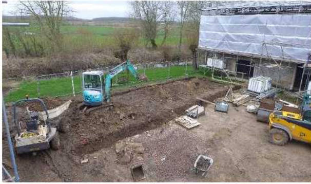
January 2020 (Footings)