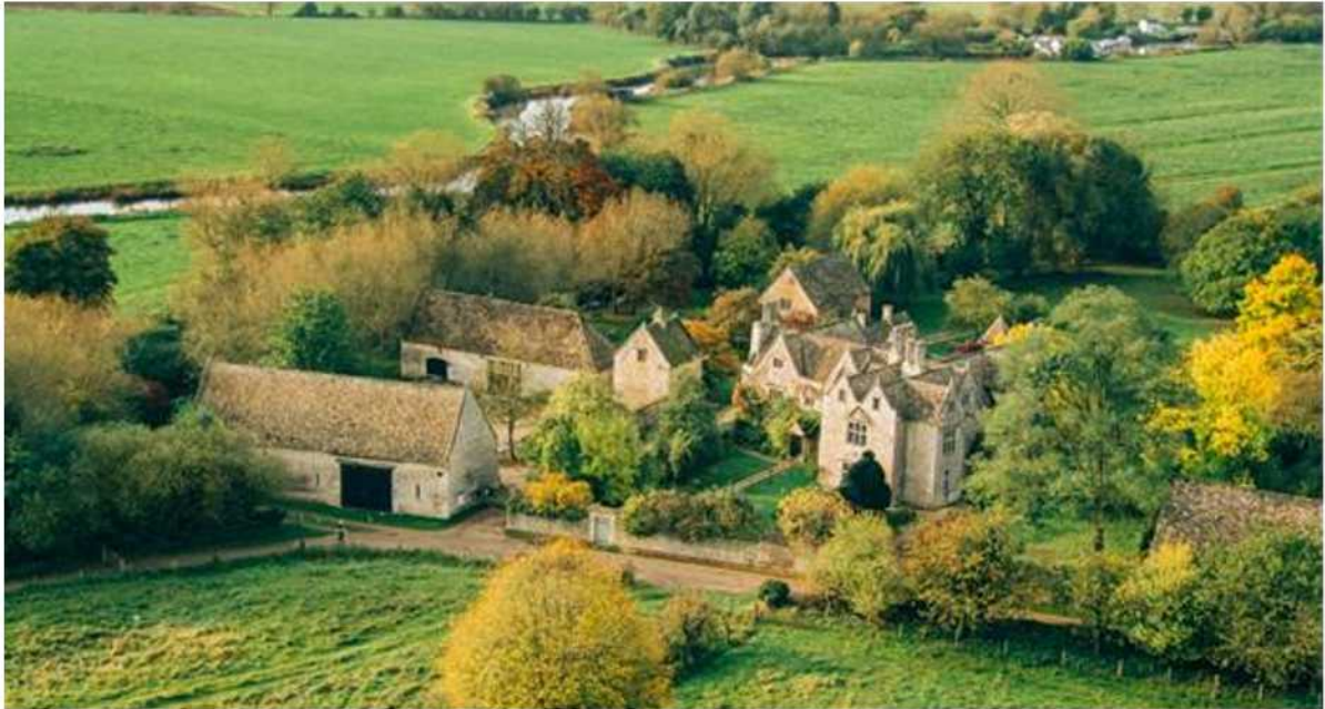
Kelmscott Manor, William Morris's 'Heaven on Earth'

Kelmscott Manor is an internationally important site inextricably linked with William Morris, his family and circle. Our plans will transform the experience by enabling people to explore the inspirational impact that the Manor and its history had on William Morris, how this manifested itself and his enduring legacy and influence on succeeding generations worldwide.