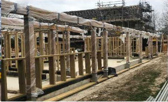
March 2020 (Frame)