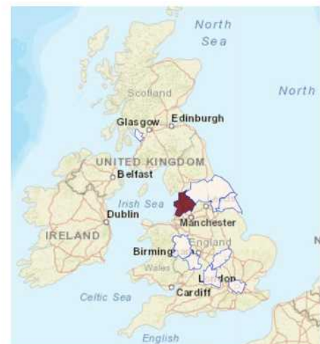
Figure 2: Density map for 10 confirmed EI outbreaks in the UK between 9 November and 10 December 2021 (https://equinesurveillance.org/equiflunet/)

EI = equine influenza, EHV-1 = equine herpes virus-1, np = nasopharyngeal, LAMP = loop-mediated isothermal amplification, 3Q = between July and September, * = where results are 'pending', additional testing may be required prior to sequencing to determine strains, this can be due to a low amount of virus present in the submitted sample.